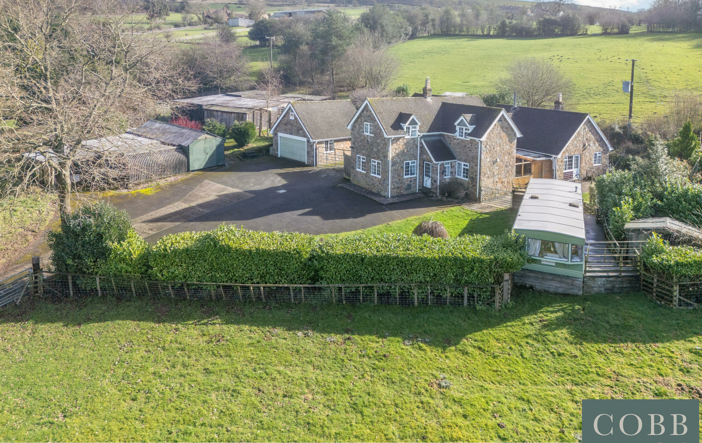
Potters Cottage, 7, Angel Lane, Ludlow, SY8 3HZ Guide Price £850,000